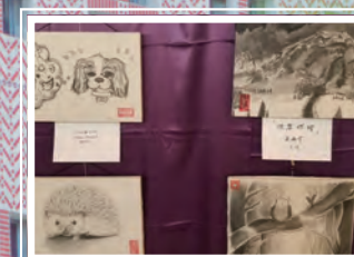
Students' works from Japanese Culture course, "Sumi-e"